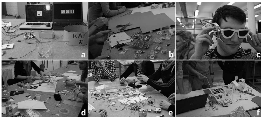
Figure 2. Workshop progress: using three different digital creation toolkits in a creative exploration of three different scenario contexts

In order to compare the functionality and potential of the toolkits, the group was split up in two smaller groups. Each group was handed a different toolkit, which they were to work with for half a day. After that time, the groups switched toolkits and worked for the rest of the day using the other toolkit within the same case.